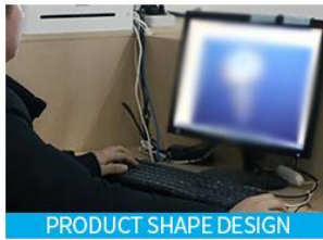
PRODUCT SHAPE DESIGN